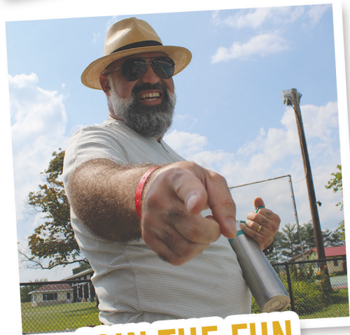
JOIN THE FUN